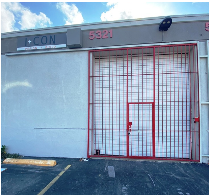
Bay 5321 | 2,500 SF