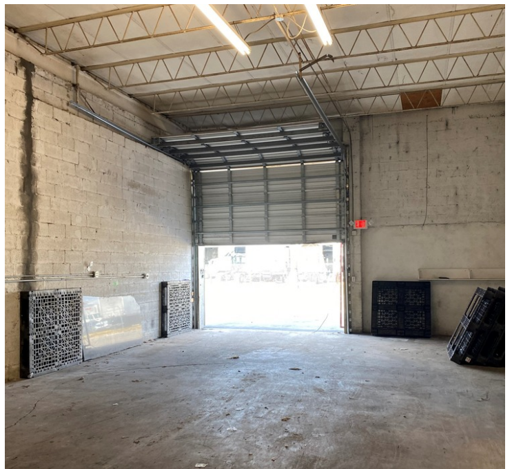
Bay 5321 | No Office, One [1] Street Level Door & Restroom