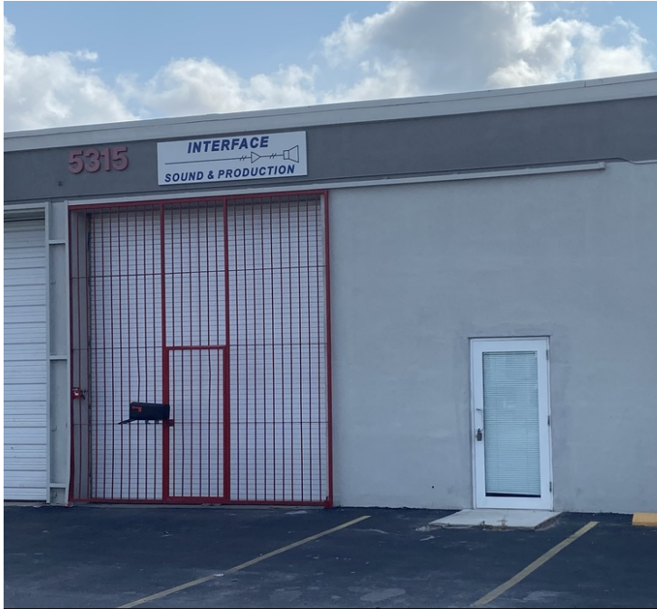
Bay 5315 | 5,027 SF