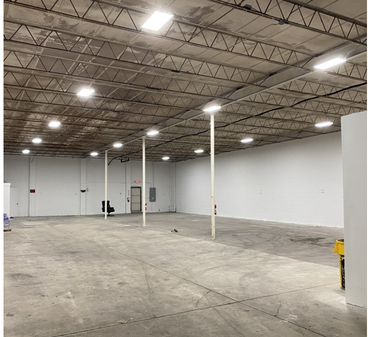
Bay 5315 | Three [3] Offices, One [1] Street Level Door & Restroom